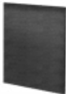
Part # MD1-0044

Maintain the high efficiency of your Sharper Image Air Purifier by regularly replacing used filters with fresh new ones. Your Sharper Image Air Purifier will indicate with an illuminated filter replacement light when it is time to change the filters. To purchase replacement filters, please email help@sihomecomfort.com or call 1-833-800-8669.