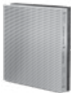
Part # MD1-0043